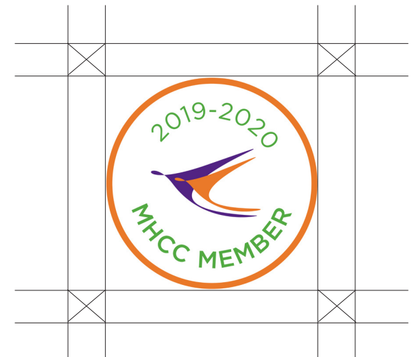
MHCC Member Badge Clear Space Requirements